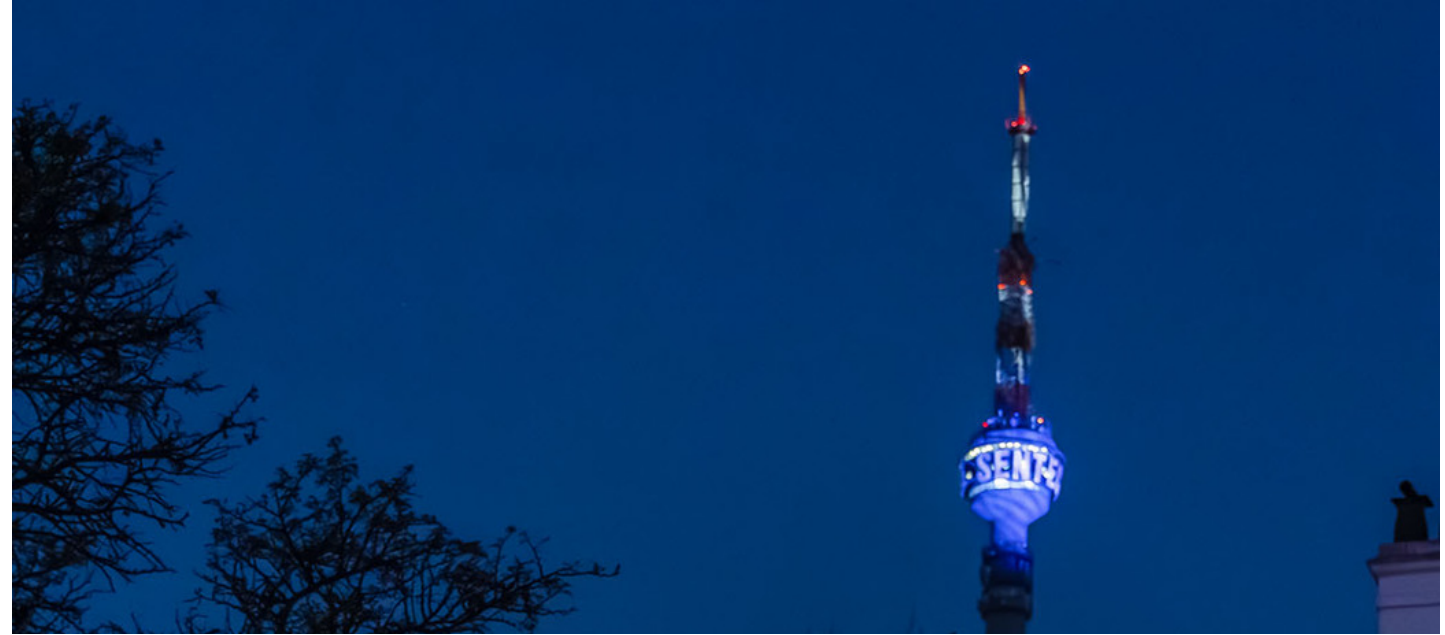
Robe Lights up Sentech Tower for Brixton Light Festival