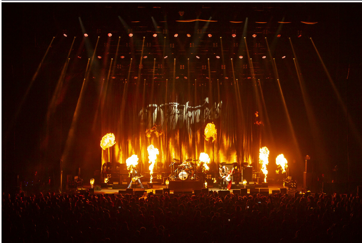
The Darkness and Black Stone Cherry co-headliner Blasts Around the UK with Robe