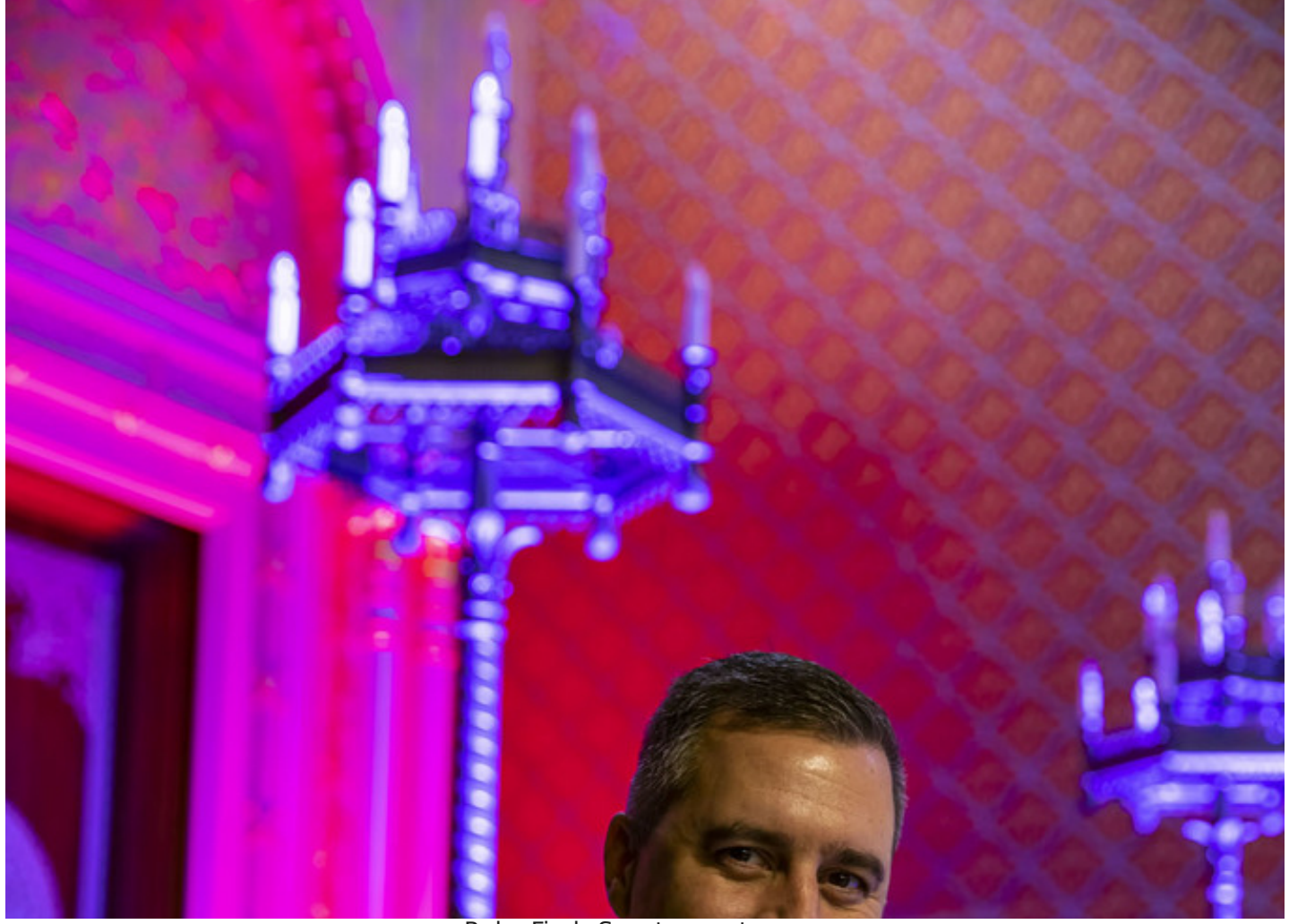
Robe Finds Sanctuary at Rumbach Street Synagogue