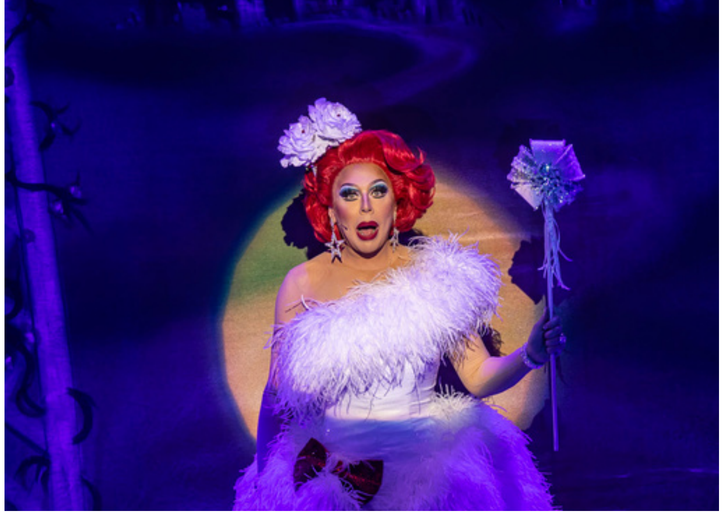
Robe Adds Magic to Cinderella Panto Production