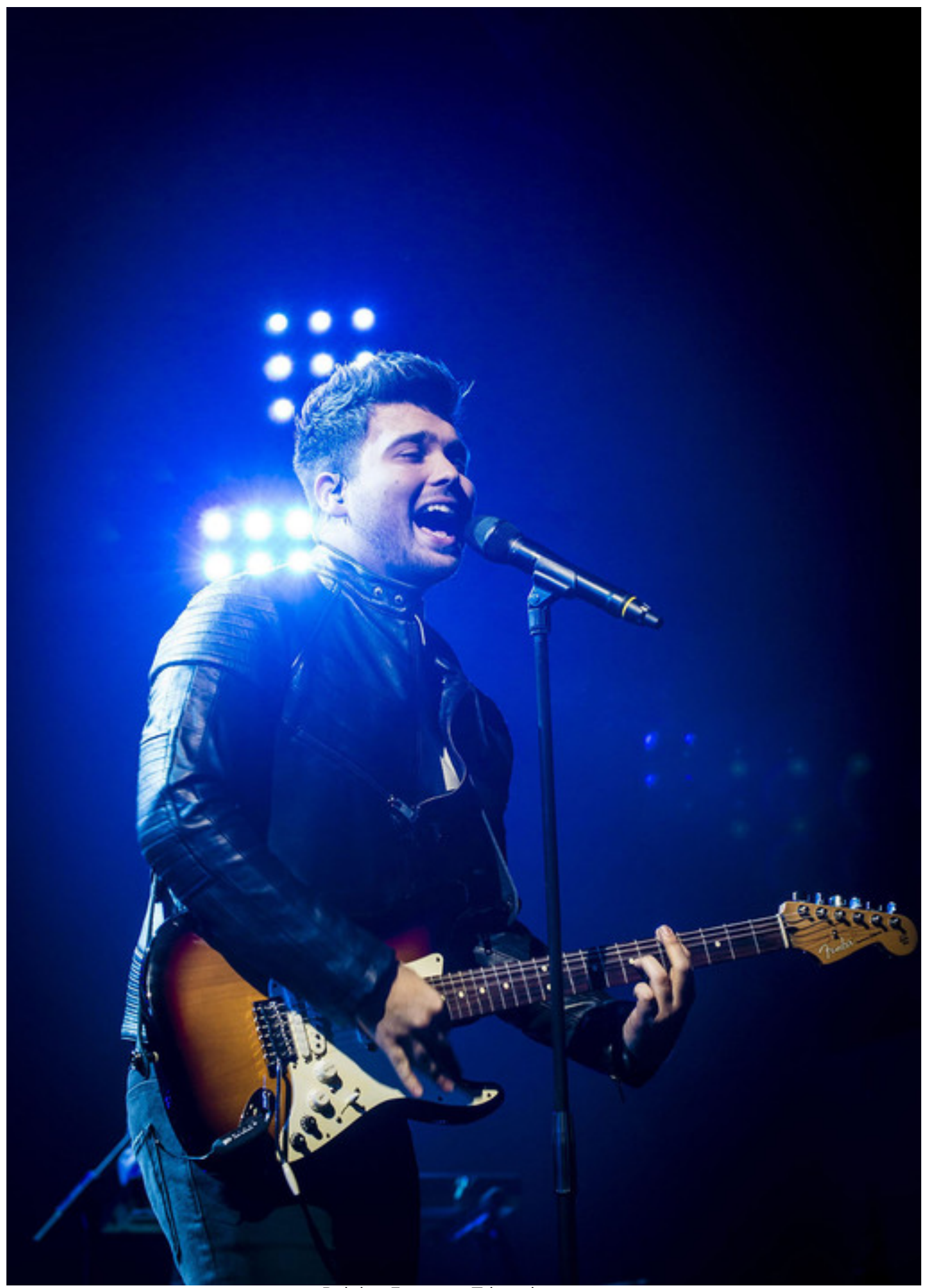
Belgian Eurosong Takes the Square Route of Robe