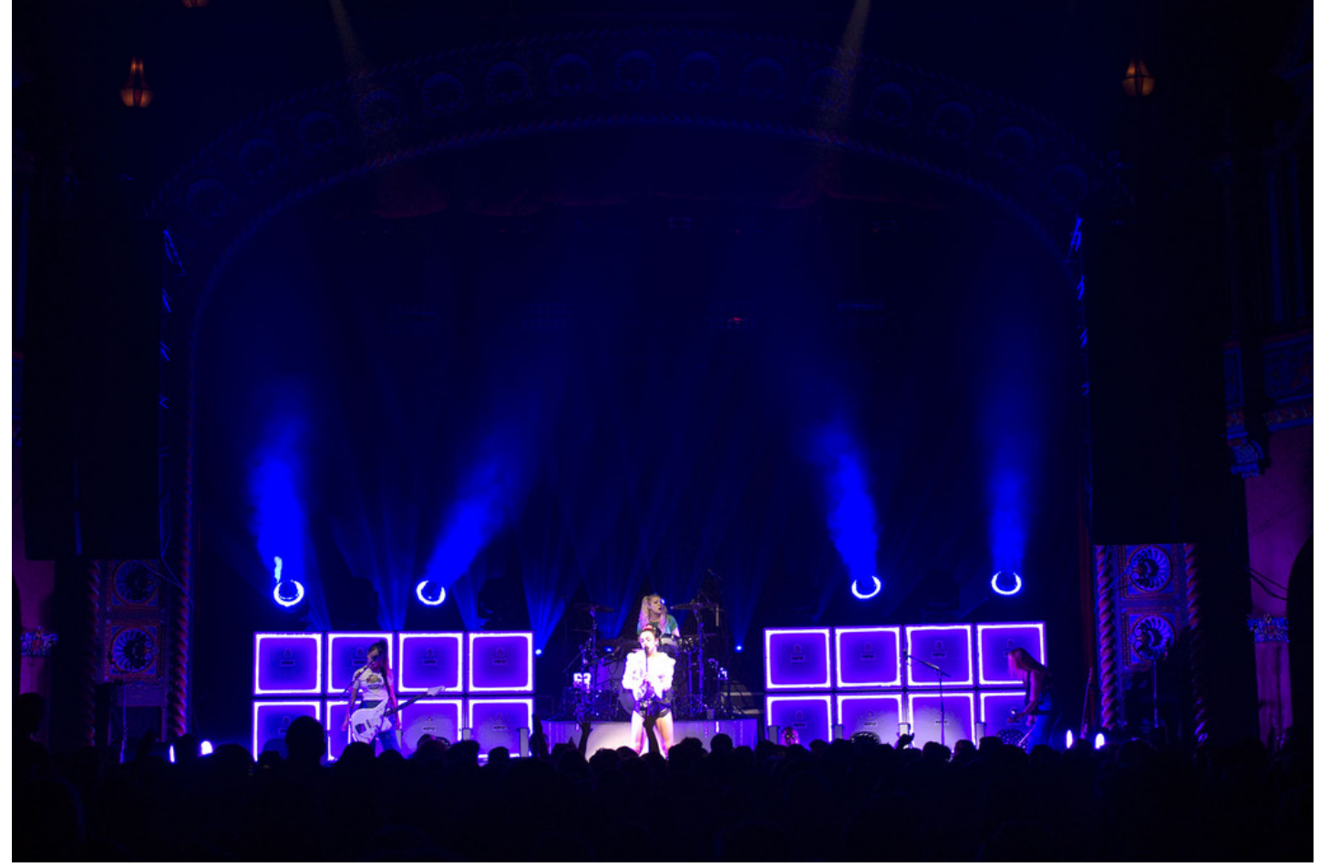
Boom Clap - Robe Cyclones for Charli XCX!