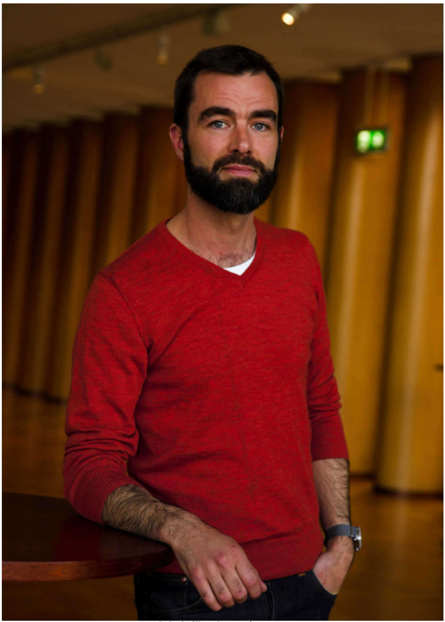
Robe is Silent Partner for Goteburg Konserthuset