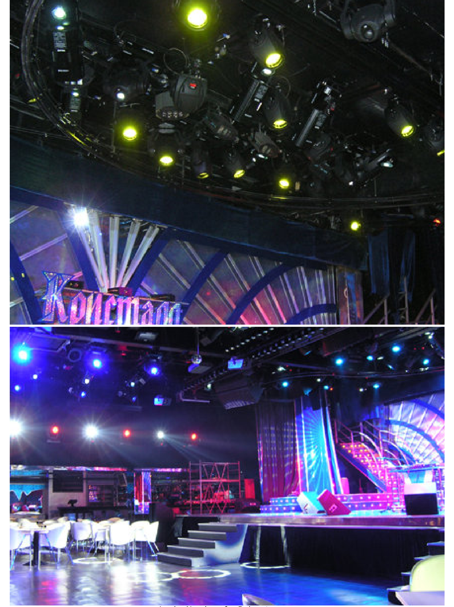
Lucky Numbers for Robe at Crystal Casino