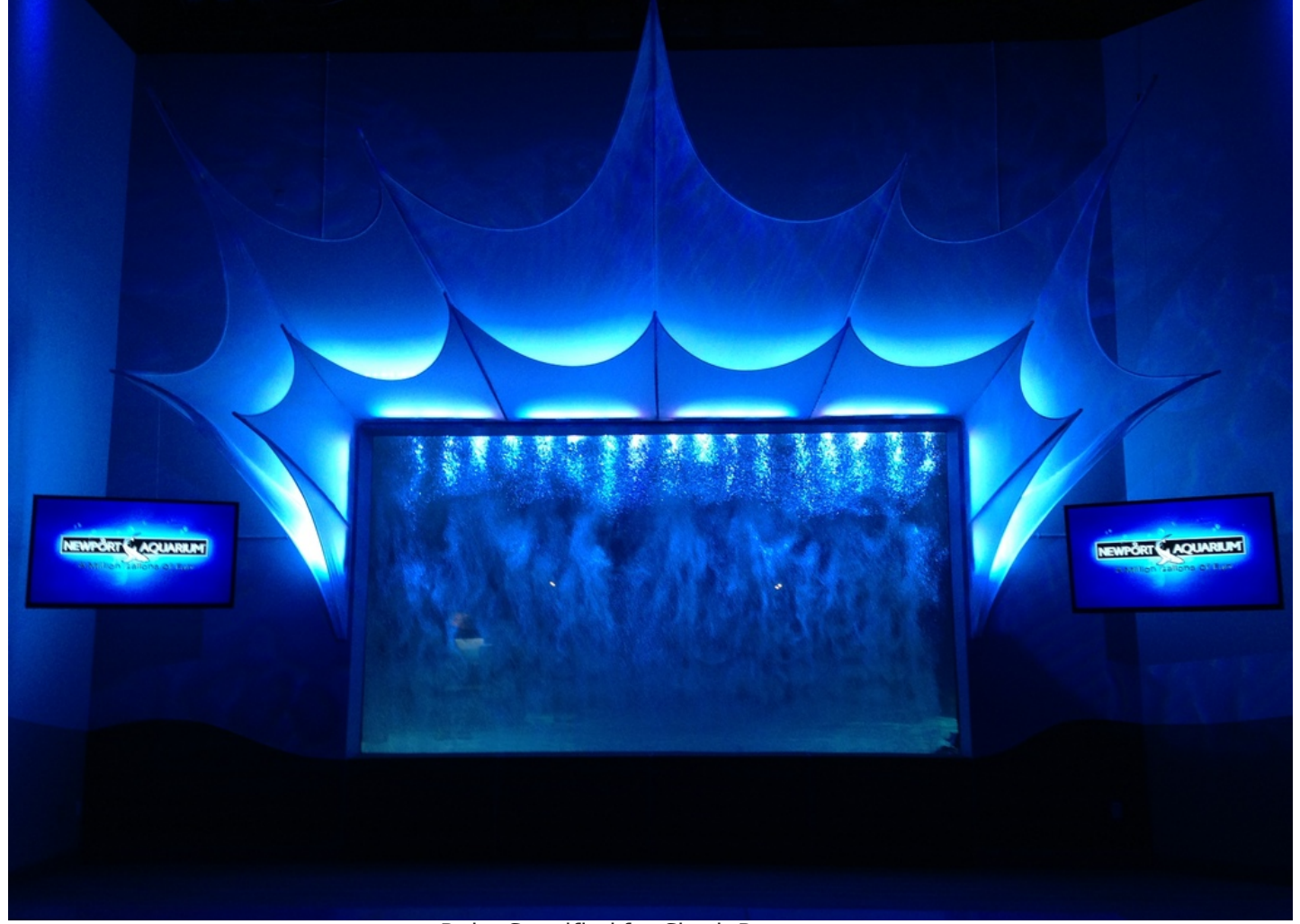
Robe Specified for Shark Ray Bay Dive Theater